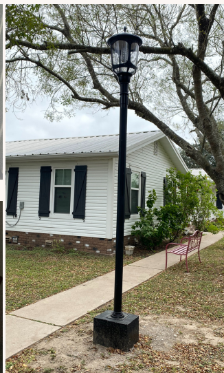
Solar Powered Exterior Lighting