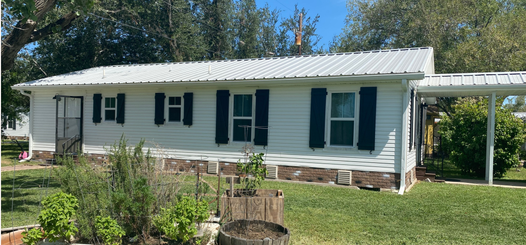
Staff House 2